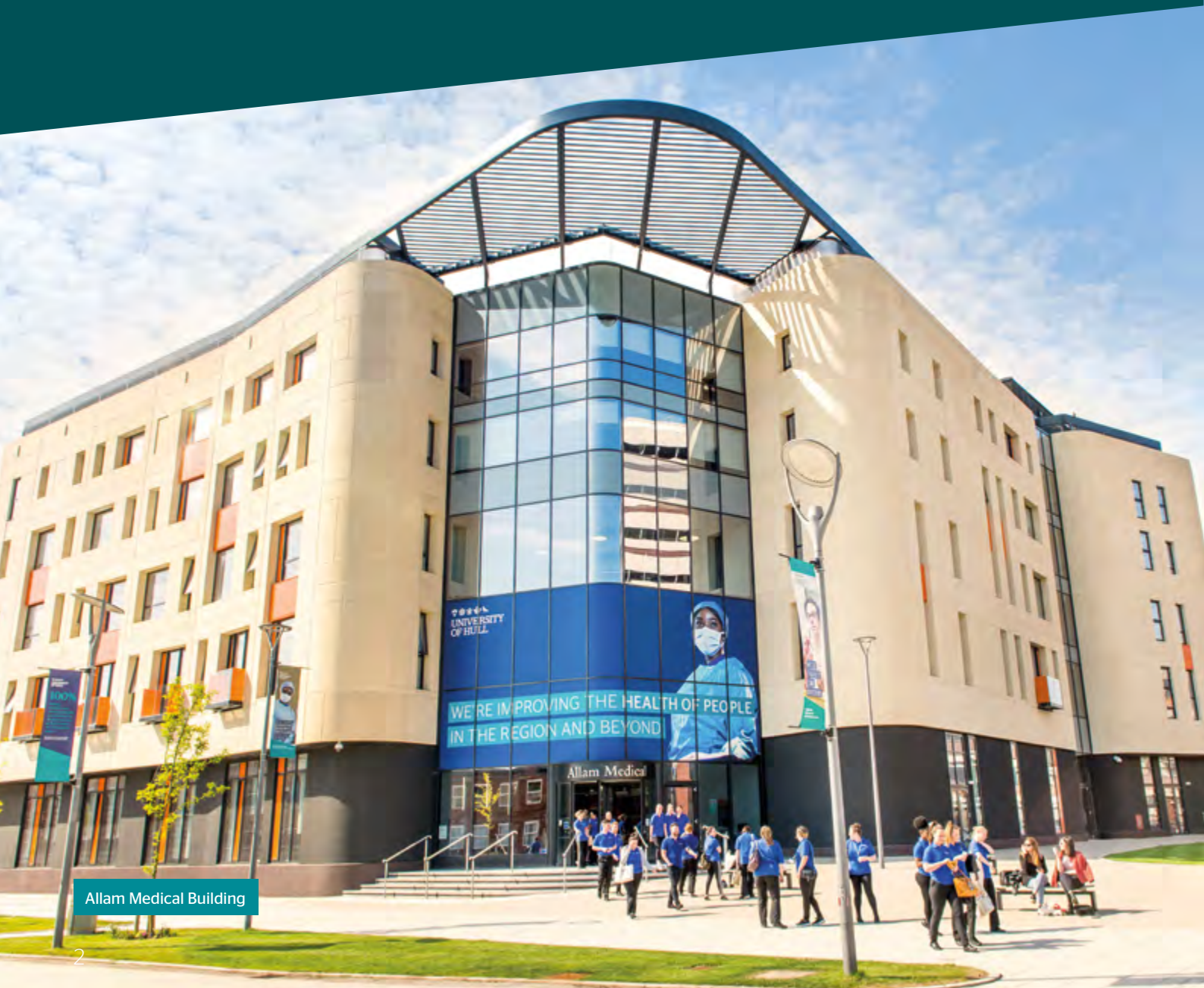
Allam Medical Building

The University of Hull warmly welcomes your application. This candidate pack provides background information regarding the University, the city of Hull and the local area. Information relating to the role and person specification is detailed within the application process for this post which can be found at jobs.hull.ac.uk .